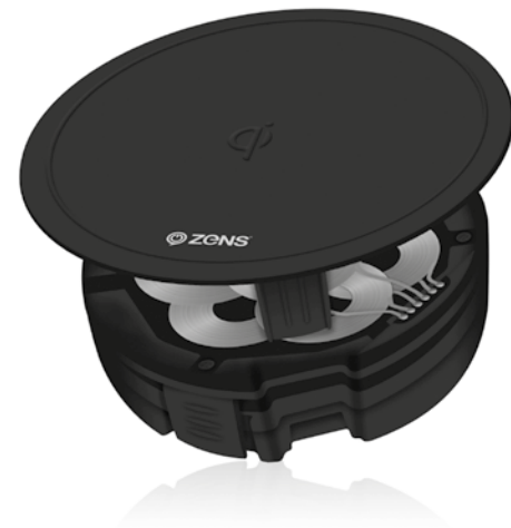
ZENS PUK WIRELESS FURNITURE CHARGER ZESC02N/00